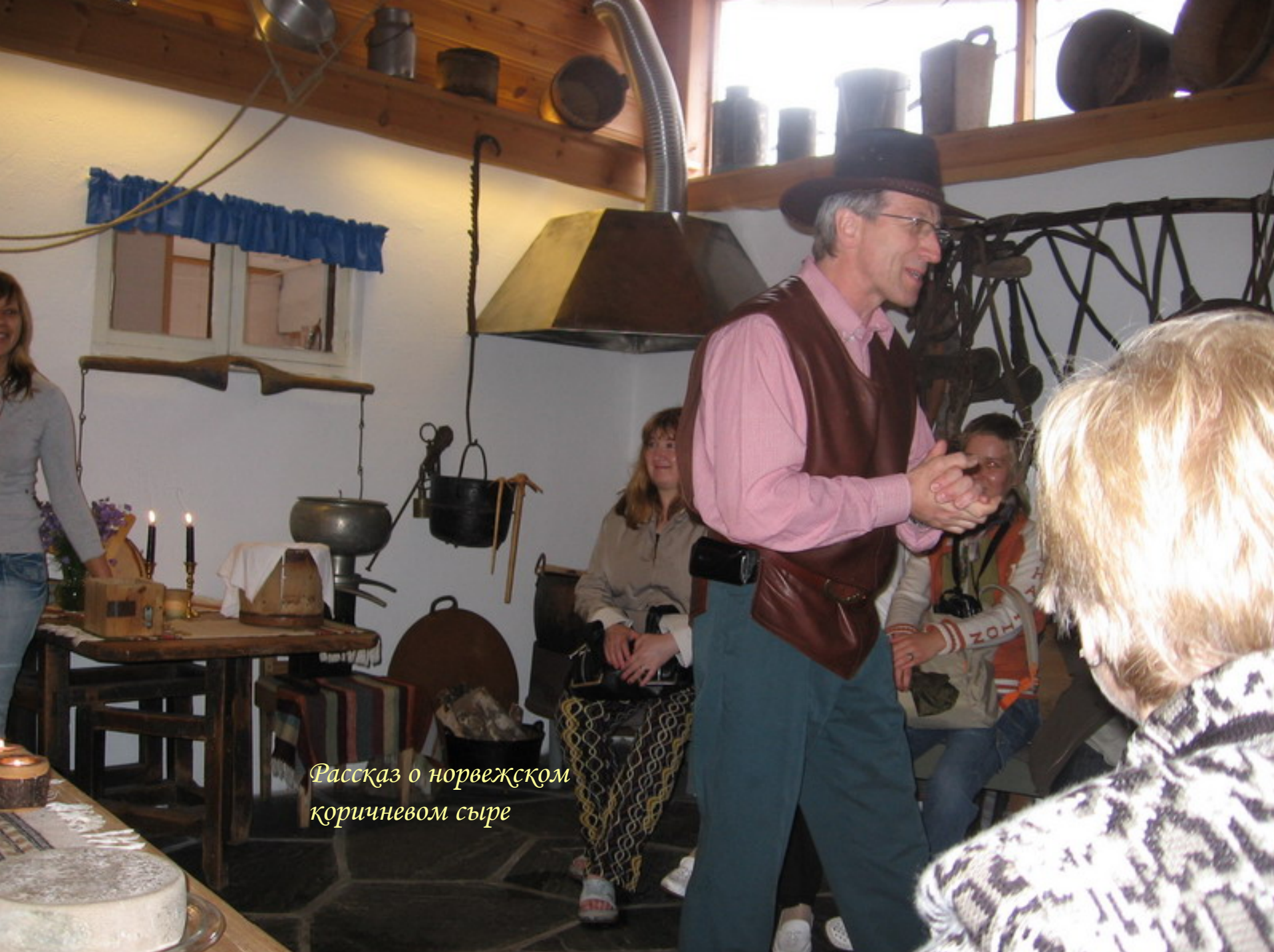
Рассказ о норвежском коричневом сыре