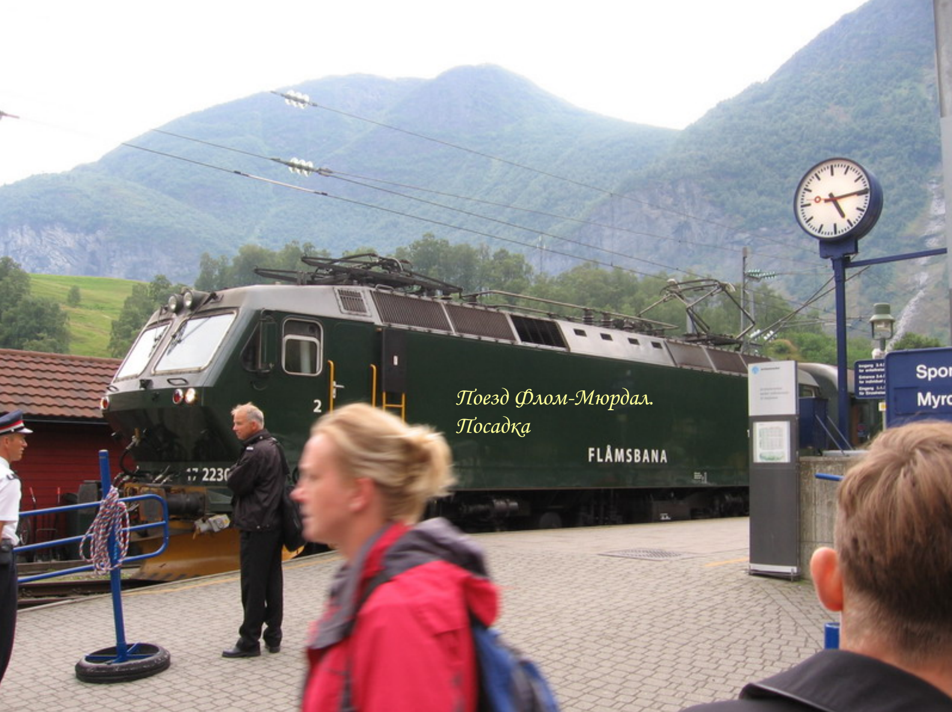
Поезд Флом-Мюрдал. Посадка