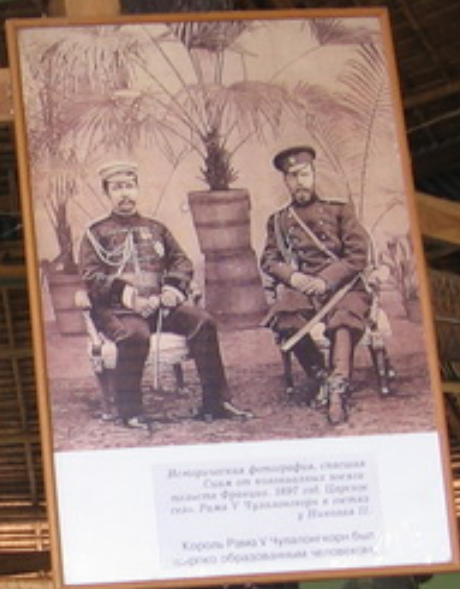
Историческая фотография, сделана в Сiam (ныне Таиланд) во время посещения Францией 1897 год. Царемสยาม - Рамой V Третьим и с ним в то время в Таиланде Р. Корень Рамы V "Человек, который был первым образованным человеком".